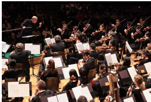
Hong Kong Philharmonic Orchestra